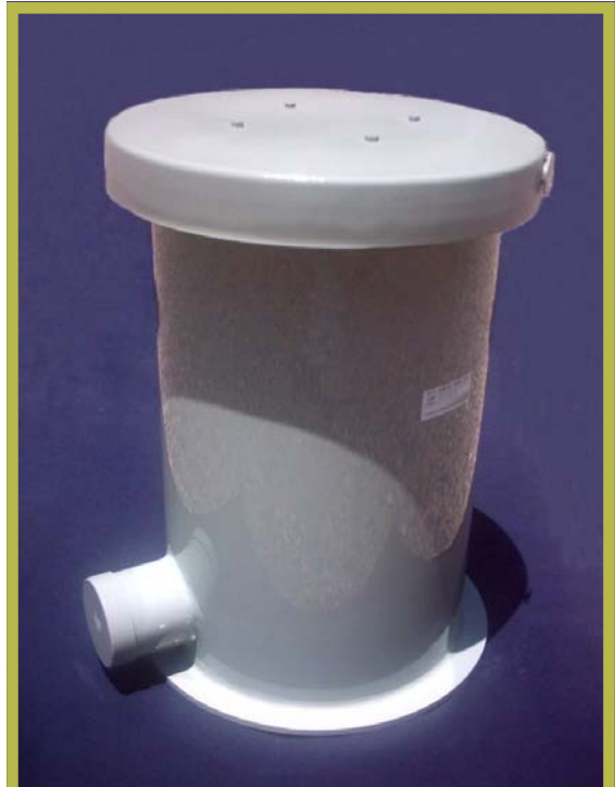
GM375 Filter Housing Replacement Media Cartridge Pack (below)

The media comes in 2 sections to make installation easier. The main ingredient in the media is a natural mineral which is particularly effective in adsorbing hydrogen sulphide ( H_2S ) molecules. There is also a small quantity of an oxidising chemical and the top layer is activated carbon.