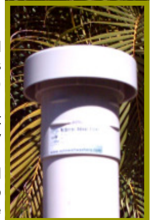
VF100 Vent Filter

The filter media consists of various grades of an absorbent natural mineral and carbon combined with a very small quantity of an oxidising chemical. Safe to handle and easily installed, replacement media cartridges are available for the VF100, VF150 and VF300 Filters. The housing is constructed of UV resistant PVC to last many years exposed to the elements and sewer conditions.