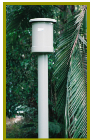
VF300 Vent Filter