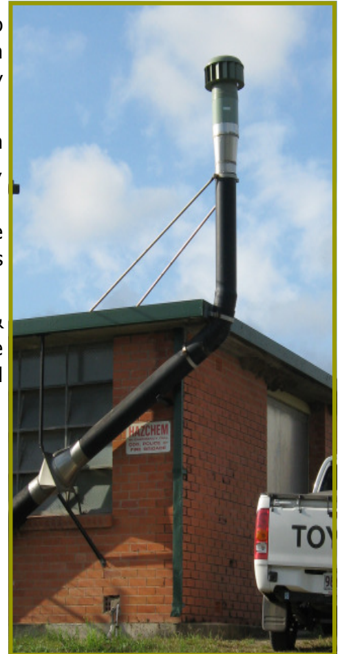
VF300 with Extraction Fan on Pump Station Building

For an Instant and Cost Effective Removal of noxious, corrosive & foul smelling gases install a McBerns Vent Filter .