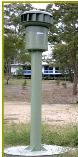
VF300 Stack with Extraction Fan