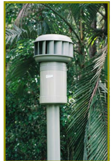
VF300 with Extraction Fan