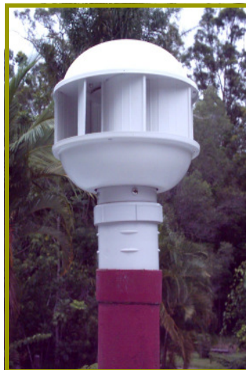
VF100 with Extraction Fan